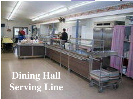
Dining Hall Serving Line