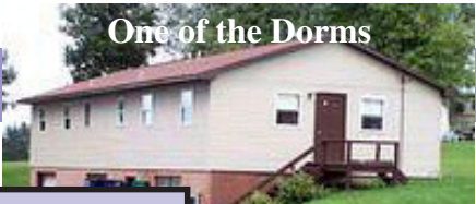
One of the Dorms