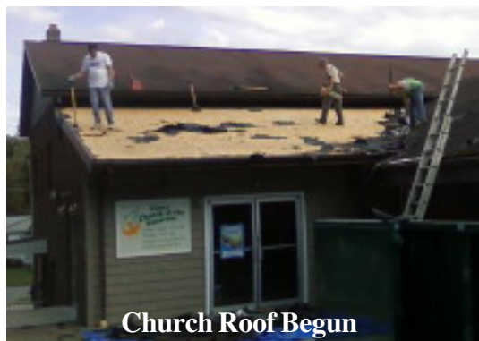
Church Roof Begun

guys kept checking their cell phones for the radar maps of the weather and it continued that way all day ... like some sort of Star Trek force field was over Corry. God is good!