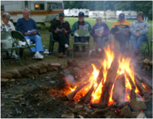
Friday Night Campfire