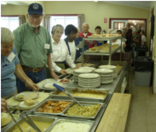
Saturday's Turkey Dinner