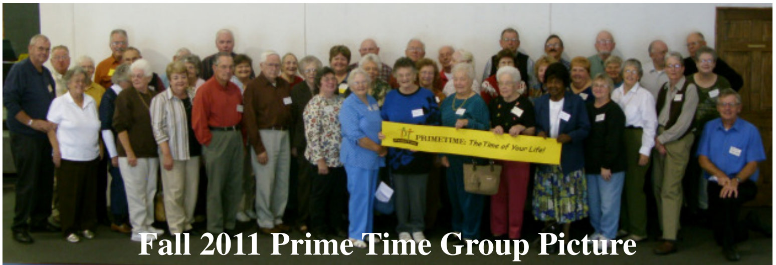
Fall 2011 Prime Time Group Picture

District Center. Many thanks to the Prime Time Committee and the District staff for providing an enjoyable two days. The noon meal was fantastic! Watch for more Prime Time events coming in the future months and plan now to participate.