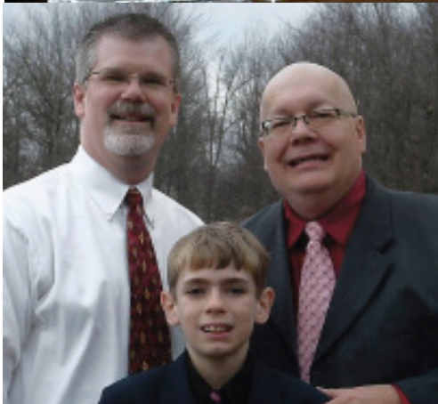
Additional photos from installation at Brookville to the left.